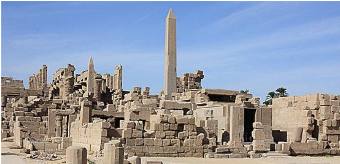
Pic1- Temple of Karnak, https://en.wikipedia.org/wiki/Karnak

Due to the availability of materials, the Egyptians have reached advanced methods of exploration of stones and minerals, transporting, lifting, cutting and polishing, which led to the advantage of Egyptian architecture by the giant scale. The Pharaonic large forms, whether a pylon or an entrance, are huge in their details because they are relatively weak sandstone in the formation. [11]