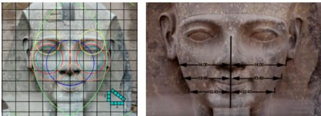
Pic5 - symmetry of statues in Egypt, (Dunn 2010)

Christopher Dunn re-examined other statues of Ramses II in Memphis and the British Museum to come to the same conclusion, the perfect symmetry between the two halves of the face. [5] Ancient inscriptions show the great relationship between humans and the universe through the sun, moon, stars, cosmic energy paths and everything they knew about astronomy at that time. [15]